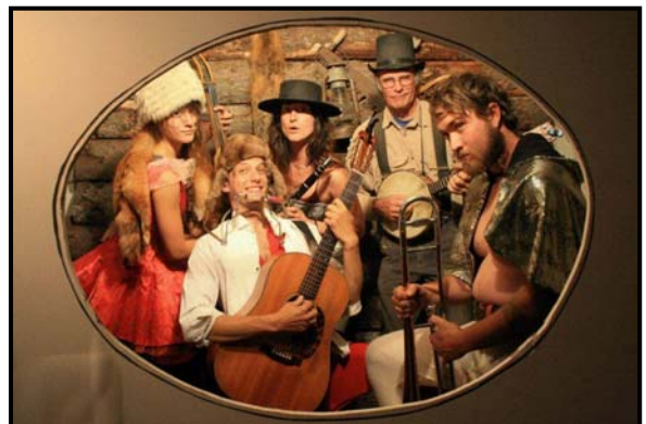
The Overby Family Band